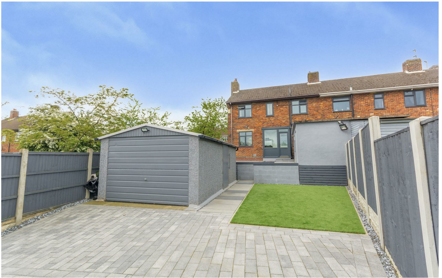
A TWO DOUBLE BEDROOM PROPERTY WITH LANDSCAPED GARDEN TO THE REAR.

Robert Ellis are delighted to bring to the market this deceptively spacious and well presented two bedroom semi detached house situated in this popular residential location, with easy access to local amenities and schools, the property has been tastefully decorated and is modern throughout and will suit a first time buyer or investor. Outside has also had a complete overhaul with new patio, composite decking and artificial lawn installed.